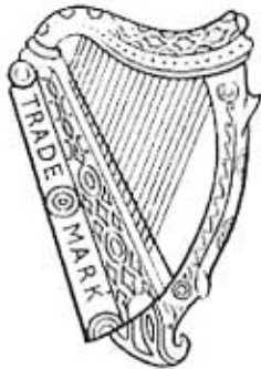
Harp device from first trademark label, 1862