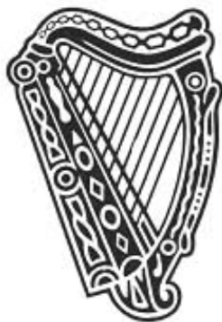
Harp device from trademark label, 1995