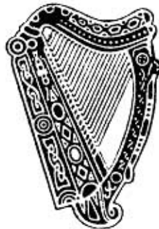
Ornamental harp, used on trademark label 1955